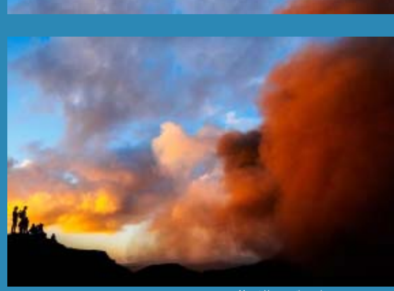
Mount Yasur active volcano

The tax haven of Vanuatu provides excellent offshore banking and banking services to private individuals and corporations. Vanuatu offshore banking centre is very active with numerous banks having received license to provide offshore banking services. Vanuatu has a number of international banks' branches and agents providing services to the public. As a tax haven Vanuatu offshore bank accounts pay no taxes on interests earned.