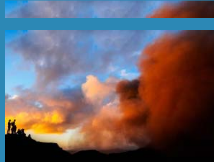
Mount Yasur active volcano

The tax haven of Vanuatu provides excellent offshore banking and banking services to private individuals and corporations. Vanuatu offshore banking centre is very active with numerous banks having received license to provide offshore banking services. Vanuatu has a number of international banks' branches and agents providing services to the public. As a tax haven Vanuatu offshore bank accounts pay no taxes on interests earned.